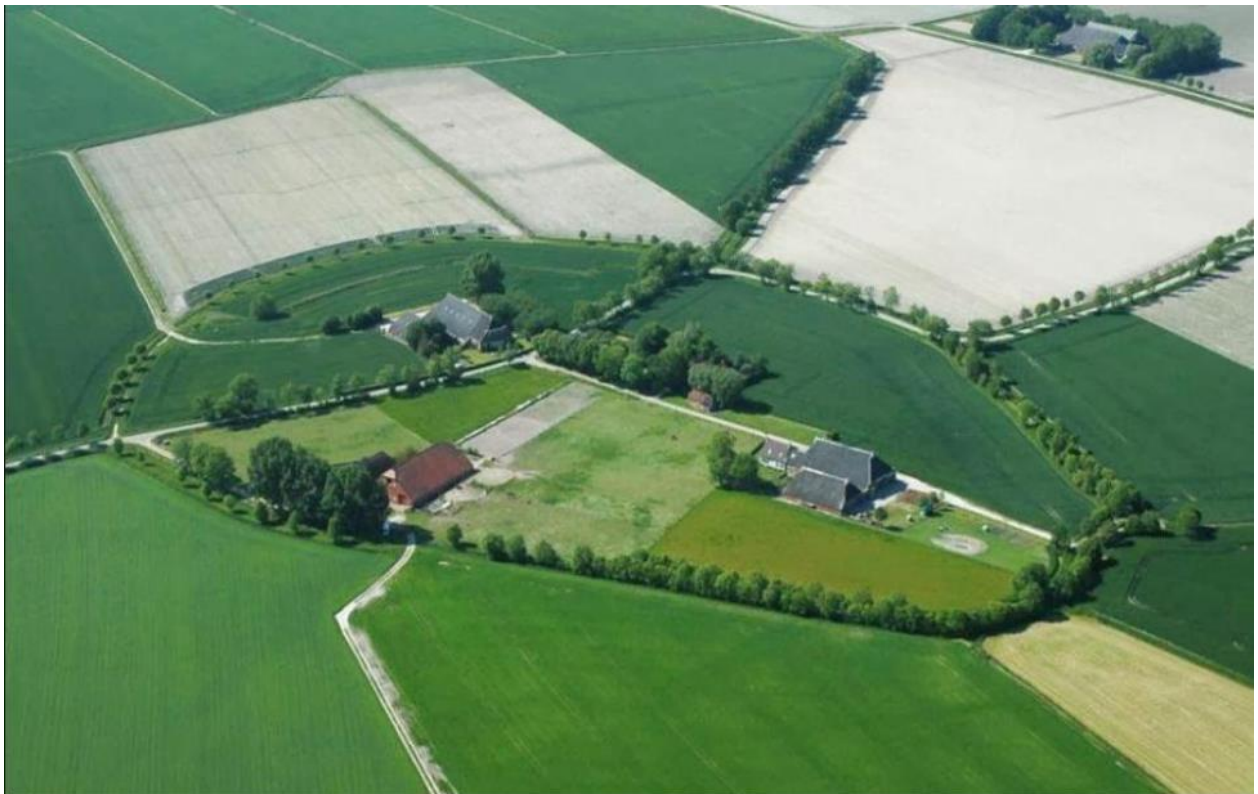
Figure 3.4 Areal picture of the Groot-Maarslag wierde.

Using the flexible geophone network (see above on section Seismological Model and Geomechanics) several campaigns to assess the shear wave velocity are planned. As described in this section, some 7 spreads will be used to obtain a detailed mapping of the shear wave velocity over the field. In areas of special concern, the shear-wave velocity will be assessed using bespoke design acquisition plans. For instance, the acquisition on wierden will be designed to obtain greater lateral granularity, while focusing on very shallow depth. The first wierde to be visited is de Groot-Maarslag wierde. The acquisition is planned to commence early 2017. After processing of the data a report will be published 1 st September 2017.