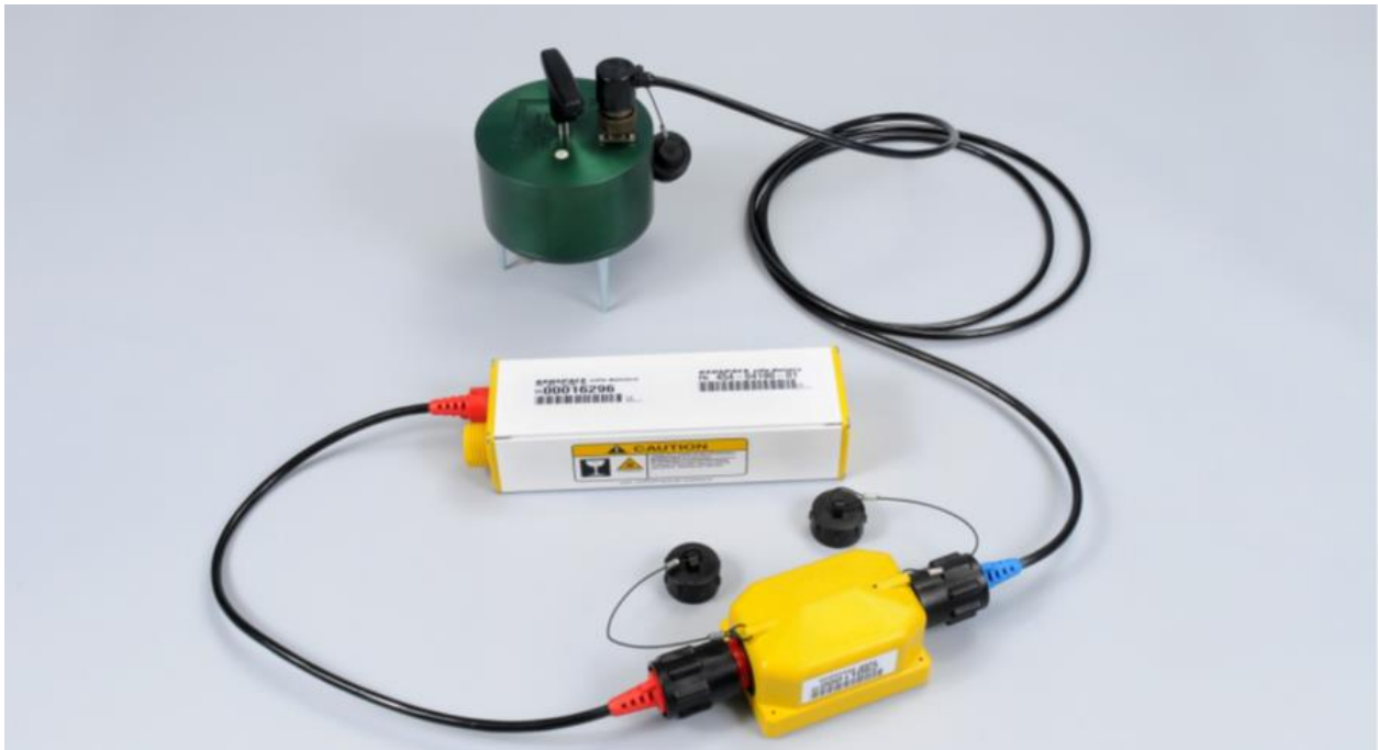
Figure 3.2 Node of the flexible geophone network consisting of the battery pack (white), data logger (yellow) and three component geophone (green).